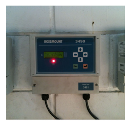
Rosemount 3490 controller used for local display and alarms