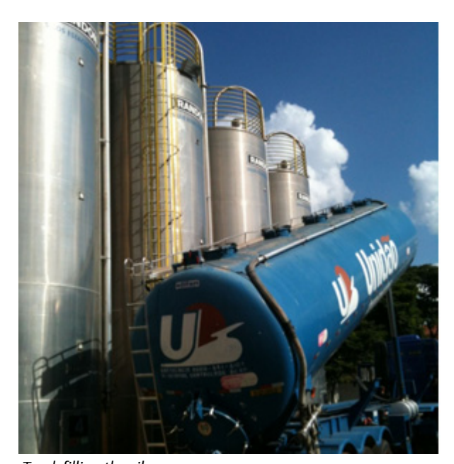
Truck filling the silos

Unipac also needed user friendly local indication which would let them know the volume of pellets available in the five different silos and could give high and low level alarms.