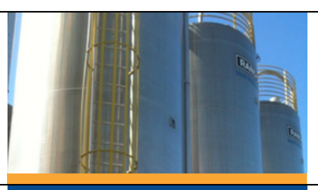
The Rosemount 3490 controller provided local indication for the Rosemount 5300 Guided Wave Radars and also enabled audible high level alarms to prevent overfilling of the silos.