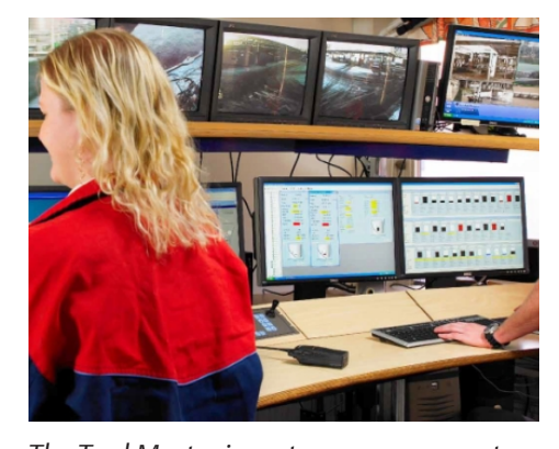
The TankMaster inventory management software is used for net volume calculations, batch transfers, reporting, alarm handling, commissioning and service.