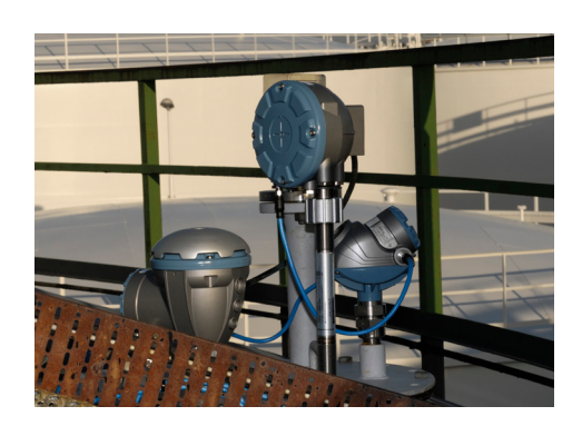
The Rosemount 5900S, 2240S and 5300/5400 gauges for level, multipoint temperature and overfill measurements mounted on the same manway.

Improved tank utilization and considerably reduced proof-testing intervals.