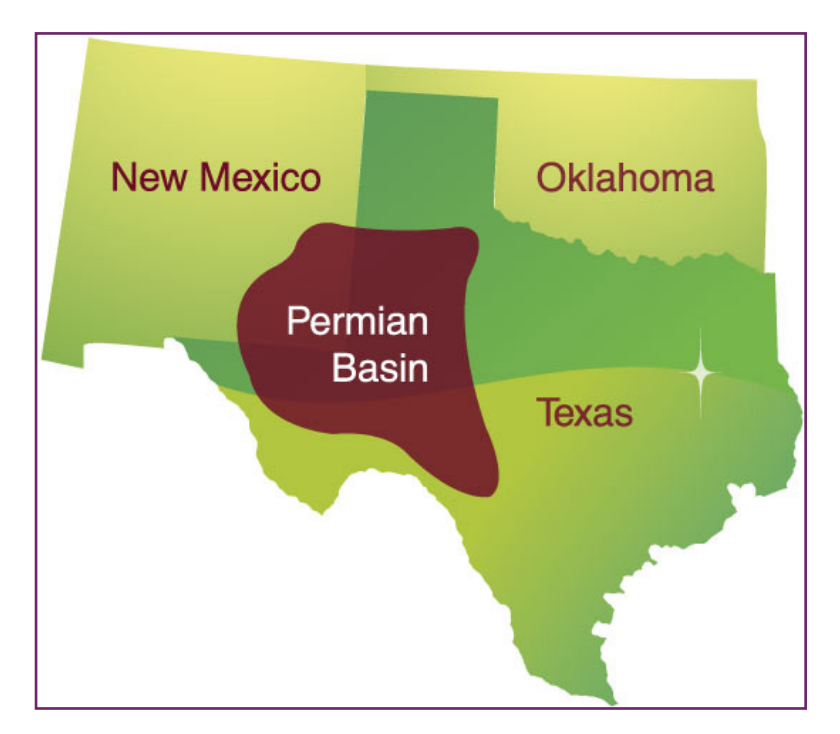
Figure 1. Tabula Rasa Energy focuses on the acquisition and development of mature oil fields, most often, under waterflood, with the ultimate goal of injection CO2 to realize an additional incremental oil wedge otherwise left stranded in ground. Its business strategy is to maximize near-term cashflow through revitalization and stimulation workovers accretive to oil production.All revitalization and stimulation projects are done with conscious effort in preparation for long-term production growth through CO2 flooding

Figure 2. CO2 injection is an attractive tertiary-flooding method because at certain temperatures and pressures the injected CO2 becomes mutually soluble with the reservoir crude, mobilizing an additional bank of recoverable oil. The general process of CO2 flooding usually involves the injection of an initial slug of gas to contact bypassed oil from a waterflood and mobilize the residual oil saturation through reductions in interfacial tension. Once the CO2 slug is injected, a Water-Alternating-Gas (WAG) process usually follows, helping maintain conformance and stability of the flood front thereby mitigating early gas breakthrough.