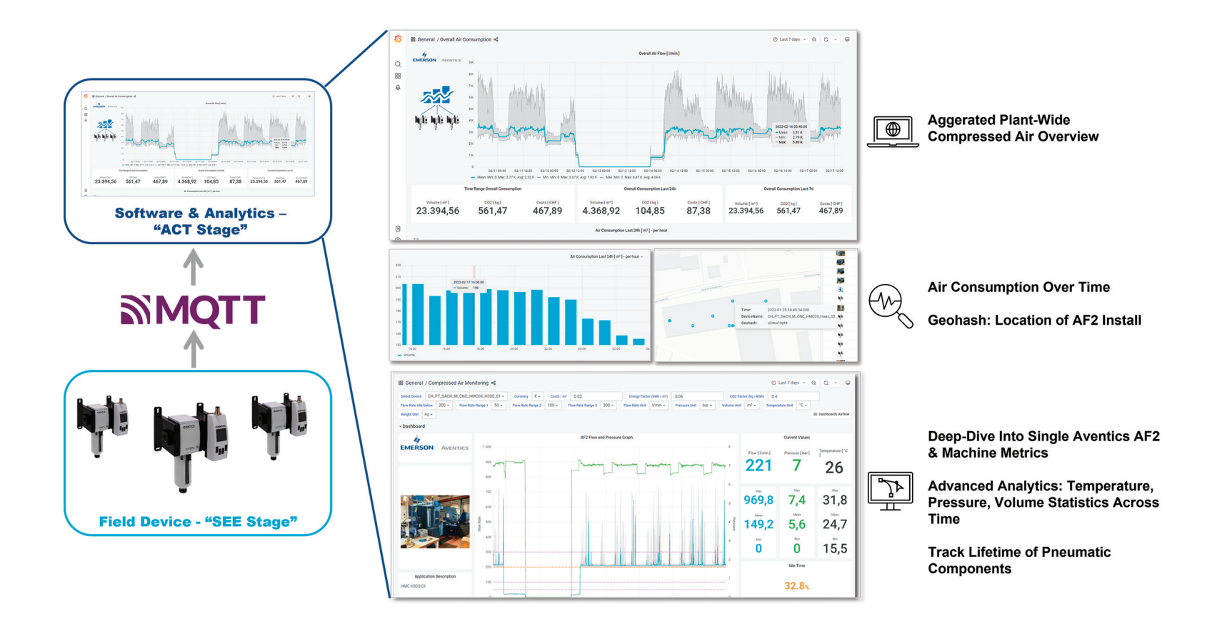
FIGURE 3: This dashboard for pneumatics applications offers a picture of a facility's pneumatic system performance in one screen, enabling quick, informed decision-making that makes predictive maintenance possible.

state of operations. This can include which cylinders are approaching end of life, have an increase in acceleration over time or have already moved past their targeted cycle time. These directives enable personnel to resolve issues before they can slow or shut down operations.