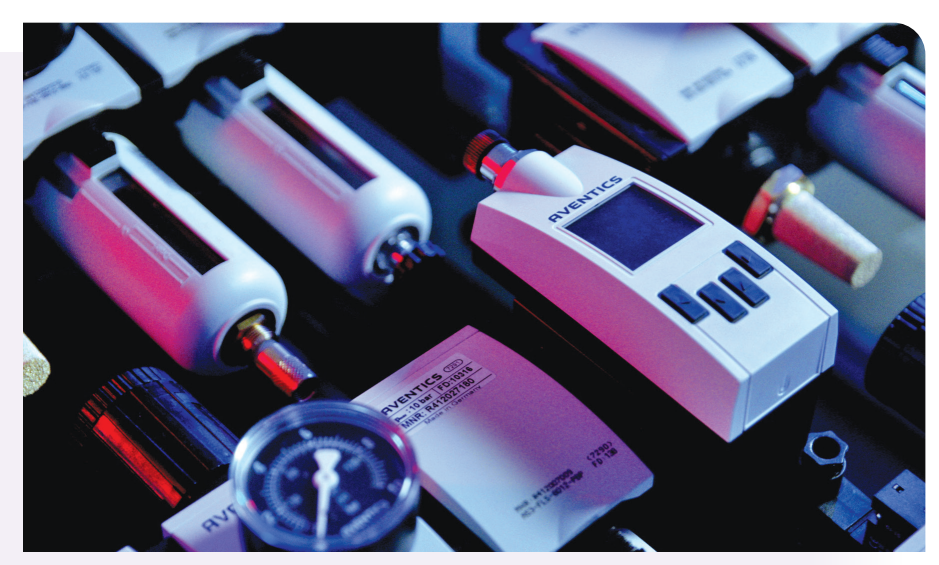
FIGURE 2 : A flow sensor can continuously monitor airflow in pneumatic systems, providing operators with clear, actionable insights regarding flow, pressure and temperature.

sumption to increase unchecked. When maintenance is performed, it's "breakdown maintenance," or fixing equipment when it fails or replacing components on a time rather than health basis. This approach virtually always incurs higher costs and unplanned downtime and negatively impacts a plant's overall energy efficiency and sustainability goals.