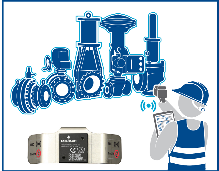
The Asset Management Tag solution is compatible for control valves, isolation valves, safety and pressure relief valves, pressure regulators, actuators, or other devices.

You need correct and current data to make smart planning and maintenance decisions, but you don't always have that information while in the field. Faded, scratched, and painted-over nameplates can make it hard to identify devices during walkdowns and routine inspections. Additionally, congested or hazardous areas can extend the timeline to perform identification tasks and can impose safety concerns for your personnel.