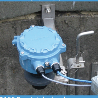
3100 Raw intake level

3051S Differential pressure for DP flow 8700 Magnetic flow meters for full pipes, Smart Meter Verification diagnostic 485 Annubar averaging pitot tubes 405 Compact orifice plates