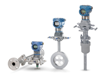
3051 for DP Flow