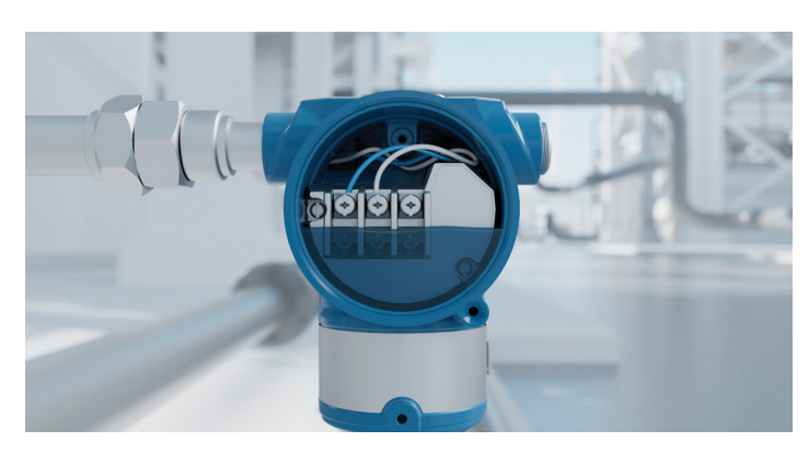
Water in the housing