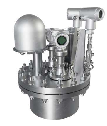
Rosemount MIF 61 Multi-Instrument Flange