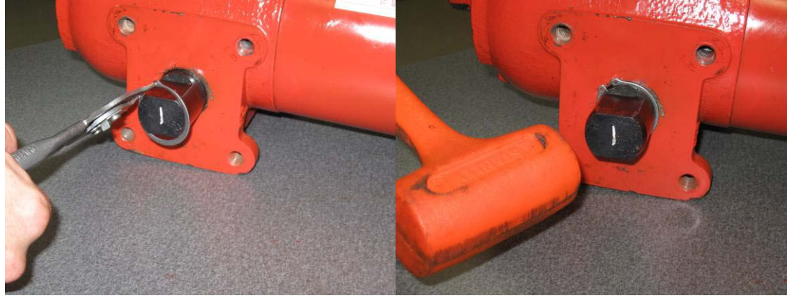
Step 12) Remove and discard side 2 Installation Seal and then install a new Rotor Clip

Step 11) On side 1, place Rotor Clip on torque-shaft. Tap this side towards the housing, pressing the Rotor Clip against the housing This makes it easier to remove the side 2 Installation Ring.