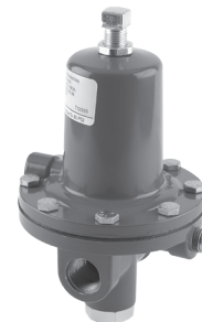
67C SERIES REGULATORS