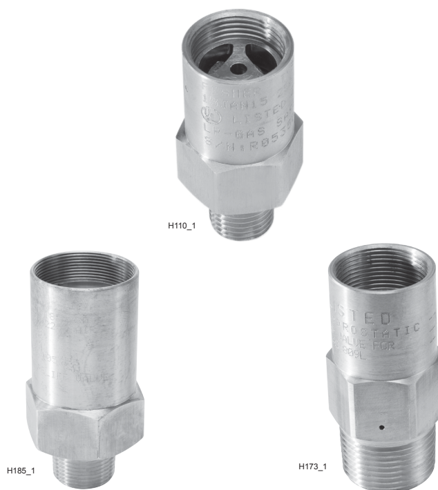
Figure 1. H100 Series

drops. Excessive tank pressure can be caused by the following: