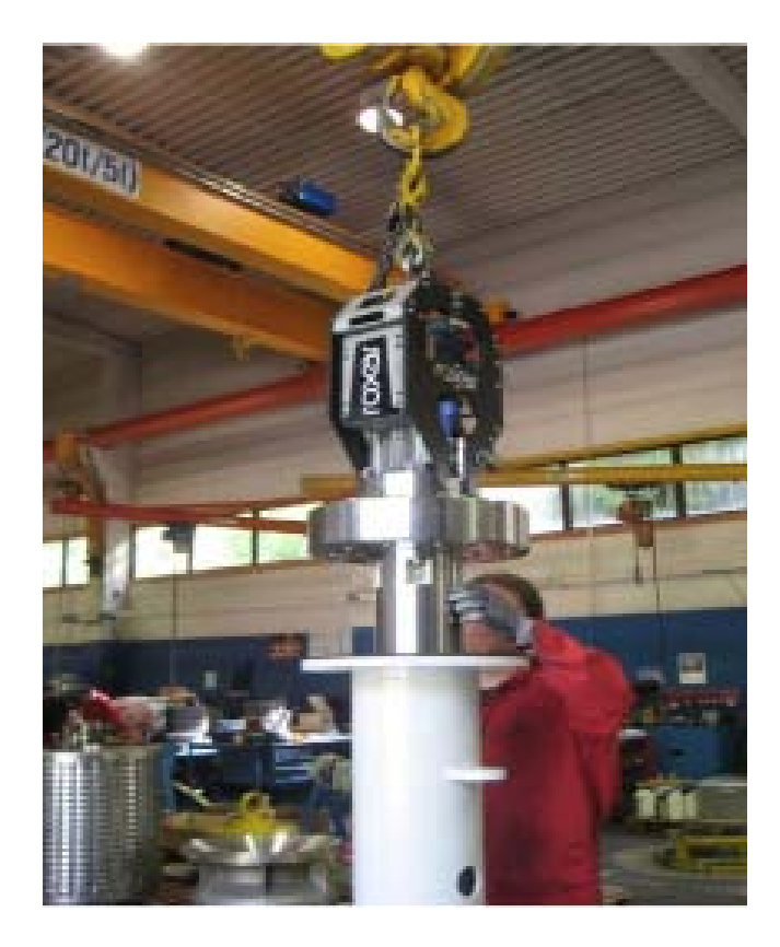
Figure 3. Taking the meter out of the shipping/calibration frame.