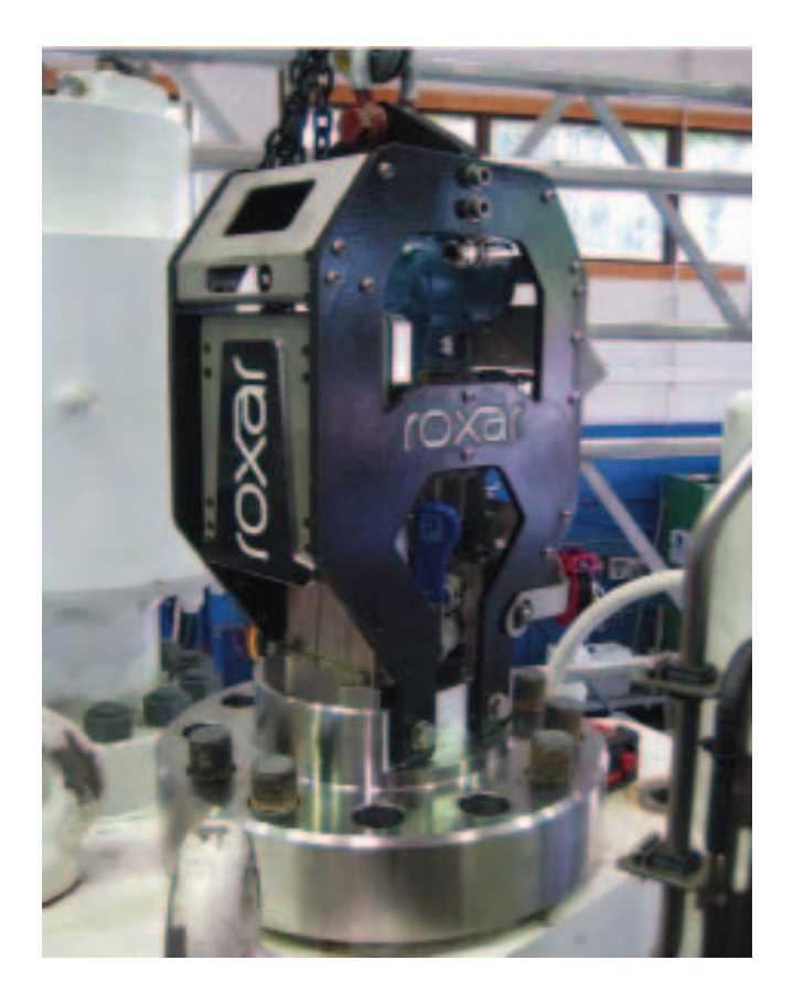
Figure 4. The fully installed meter.

multiphase meter into an Xmas tree. The main rationale behind this was to offset the high cost of retrofitting a multiphase meter onto existing pipelines - a process that involves the cutting of pipe and other modifications and can cost several million US dollars.