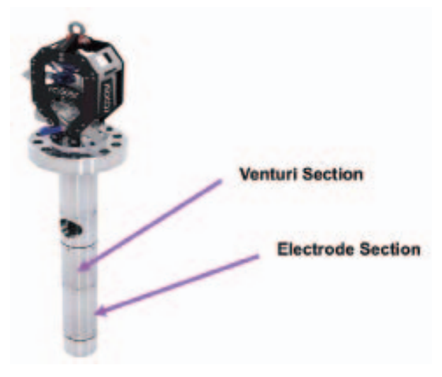
Figure 1. The Roxar Wellhead Insert meter.

At a time when operators are producing from ever-more challenging fields and are under pressure to make smaller, older fields more economically viable, the need to measure complex flowrates in real-time and with greater accuracy has never been more important.