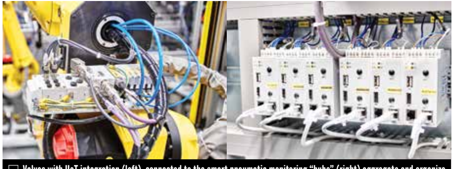
🗌 Valves with lloT integration (left), connected to the smart pneumatic monitoring "hubs" (right) aggregate and organize pneumatic performance data and deliver it through separate, parallel pathways to plant management systems.

Although these plug-in valves reduced parts and labor costs for individually wiring each solenoid coil, they did not incorporate diagnostic feedback and other operational information that can be useful. Capturing that additional information would require separate sensors wired back to the PLC I/O cards to measure and verify correct functionality. This functionality data could include cylinder position, spool position, pressure, flow and other useful information.