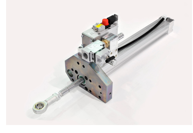
Emerson stretching units can perform up to 2,400 cycles per hour in the SBM process.

Pneumatic technologies and products play a vital role in a wide range of packaging systems serving the consumer products markets. They provide reliable, proven and efficient systems for a wide range of actuation and material movement tasks within many types of packaging systems. The newest generation of smart pneumatics lets them integrate seamlessly into digital packaging machine environments thanks to onboard intelligence and compliance with all relevant commu-