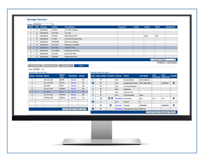
AgileOps Alarm Settings View.