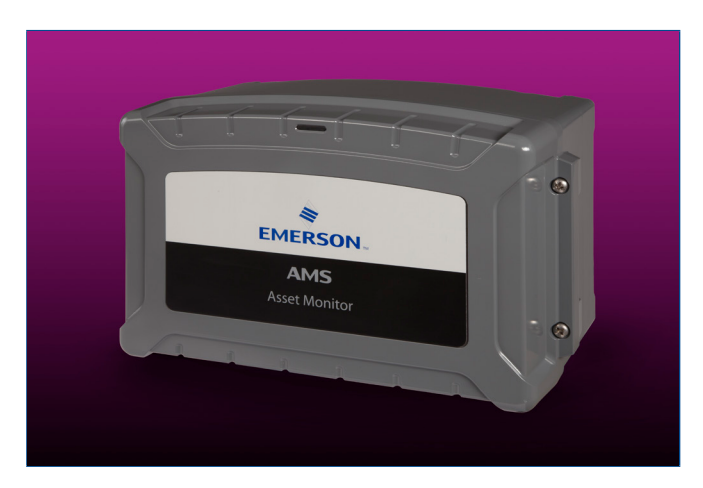
AMS Asset Monitor ASI provides timely notifications to respond to alerts quickly and achieve maximum productivity.