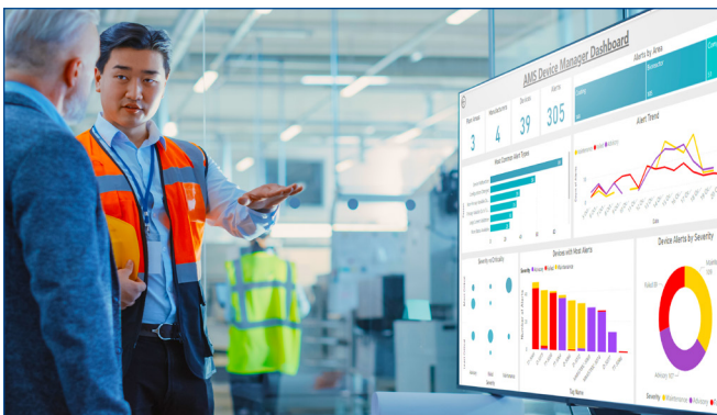
Microsoft PowerBI KPI and Analytics dashboard displaying smart device data via AMS Device Manager Data Server capability.