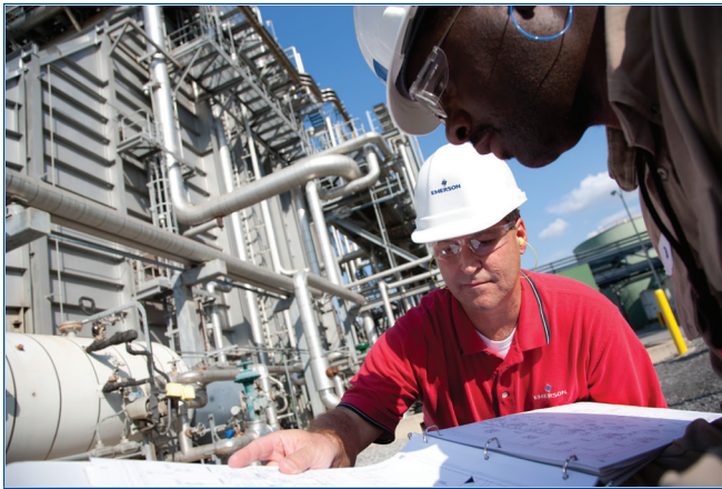
Emerson-certified experts in AMS Optics installation will customize a plan for your site or enterprise.