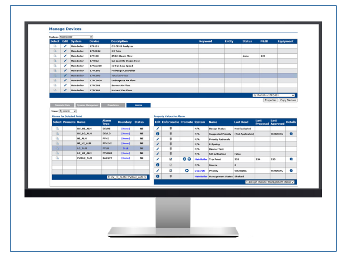
AgileOps Alarm Settings View.

AgileOps provides the real-time capability to view the control system configuration, recommend and collaborate on design changes, implement changes in the control system, and audit the configuration versus the design. DeltaV AgileOps Database is an online database that monitors the control system for changes, detects new and deleted devices and alarms, and drives the work process for rationalizing alarms and control system settings. The system allows users to audit changes to alarms and keep detailed operator and engineer data about the alarm configuration. Based on the information provided, AgileOps will recommend the alarm priority based on the alarm priority matrix from your site's alarm philosophy. AgileOps can connect to multiple control systems to allow the user to view and manage alarm configuration in the same way across the site. With a consistent toolset and interface, the same processes can be used for alarm rationalization design and implementation for all control systems across a corporation.