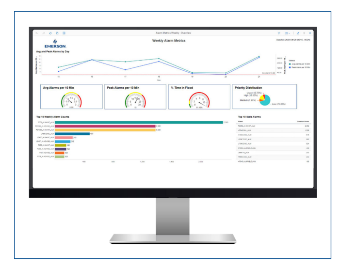
AgileOps Performance Analytics Dashboard.

AgileOps Performance Analytics allows the measurement, tracking and reporting of key performance indicators for events occurring in your facility. AgileOps reports alarm metrics as a result of data analysis which it automatically collects from one or more control systems. Metrics can be analyzed by the minute, hourly, daily, weekly, monthly or on a yearly basis. AgileOps is designed as an enterprise application that provides the necessary detailed information from local unit personnel up through complex-wide and cross-facility views for the enterprise.