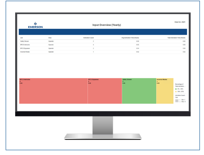
AgileOps Operational Limits Report.

Monitor and track digital inputs in your control system with AgileOps Operational Limits. This allows users to track digital inputs (by user defined names), automatically aggregate them (by user defined named lists) and generate metrics when those inputs enter a specific state. AgileOps Operational Limits monitors inputs, using real-time data, to determine if it is active, and then tracks the counts and duration of activation. AgileOps will then automatically aggregate that metric based on the list the input is in. The results can be viewed via AgileOps Performance Analytics. These reports include data on individual raw events, metrics on individual inputs of lists, and metrics of the overall status of the aggregated lists.