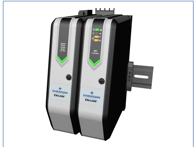
The MX Controller.

Cold restart. This feature provides automatic restart of the controller in case of a power failure. The restart is completely autonomous because the entire control strategy is stored in NVM RAM of the controller for this purpose. Simply set the restart state of the controller to current conditions.