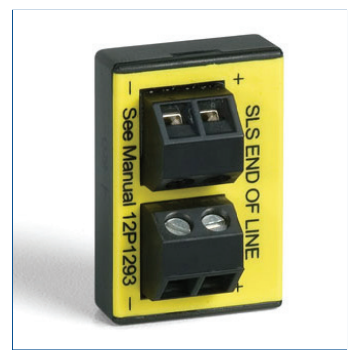
End of Line Resistance Module.