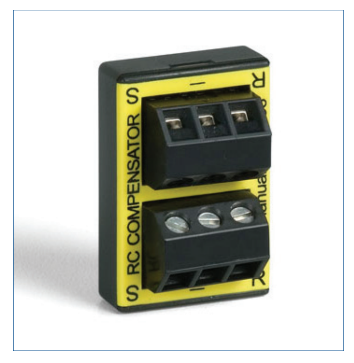
RC Compensator Module.