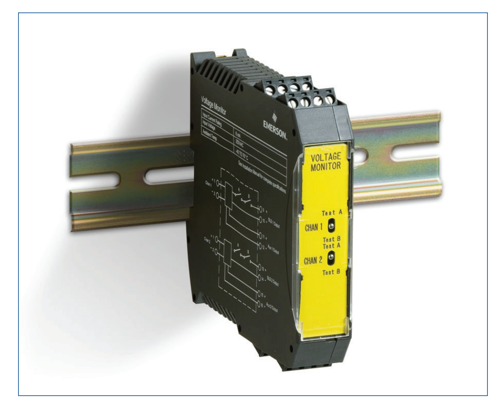
SIS Voltage Monitor.