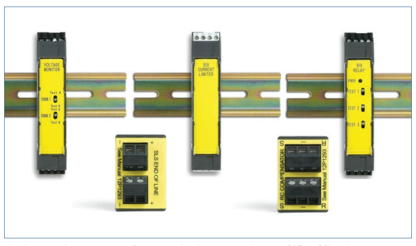
The DeltaV SIS ^{\infty} conditioning components allow you to use the DeltaV SIS system with a variety of different field signal requirements.