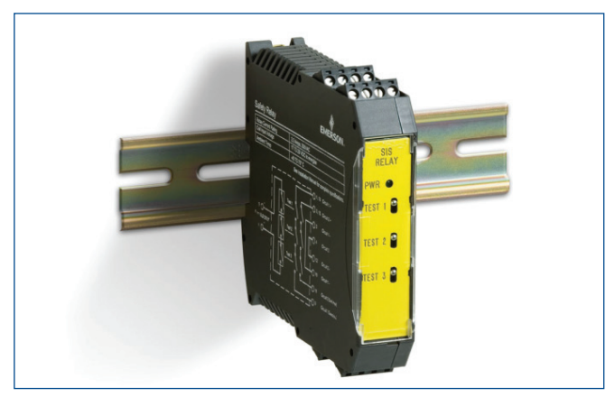
SIS Relay Module.

A relay coil is energized for all three relays in normal operation. If a demand occurs, the SLS removes the power from the coil for all three relays at the same time. Each relay can be proof-tested in the field.