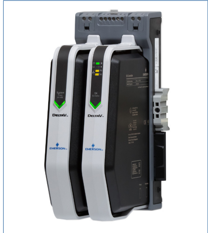
The SX Controller.

Field Proven Architecture. The SX controller is an evolution of the DeltaV MX controller. The new design delivers installation and robustness enhancement while still using the same processor and OS that has proven itself in the field. All IO cards run the latest software enhancements of corresponding M-series IO cards and deliver the same field proven, reliable operation.