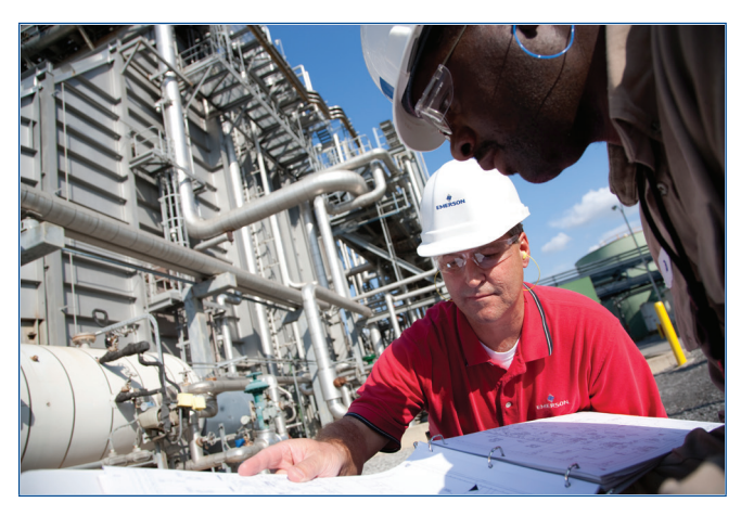
Emerson-certified experts in AMS Optics installation will customize a plan for your site or enterprise.