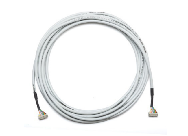
The 6m long 20 pin – Standard Round Ribbon Cable is recommended to be used with discrete signals for distances longer than 3m. (20-pin DI/DO shown above)