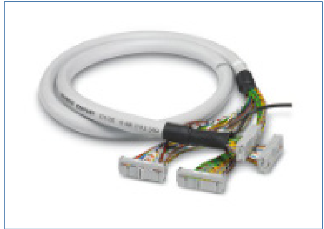
The 6m long 48-pin – Special Round Ribbon Cable is recommended to be used with analog signals for distances longer than 3m.