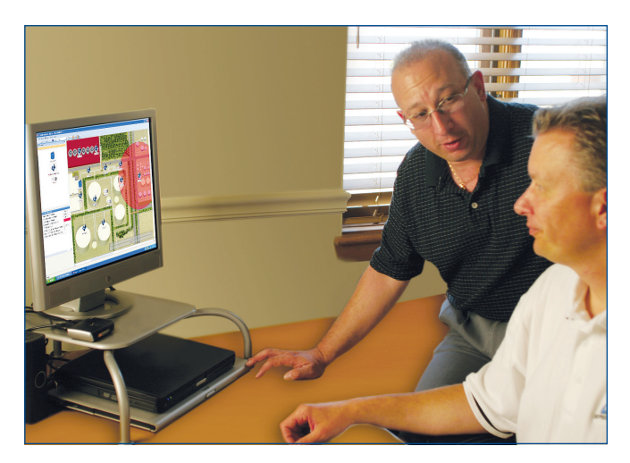
Gain additional diagnostics and configure advanced devices with SNAP-ON applications to AMS Device Manager.