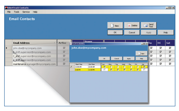
Set alert parameters and route to the right people at the right time using the AlertTrack SNAP-ON application.

AMS ValveLink monitors the health of the valve assembly and provides customized diagnostics for advanced troubleshooting. You can detect problems with air leakage, valve assembly friction and deadband, instrument air quality, loose connections, supply pressure restriction, and valve assembly calibration. When a problem is identified, AMS ValveLink provides a description of the problem and severity indicator, a probable cause, and a recommended action.