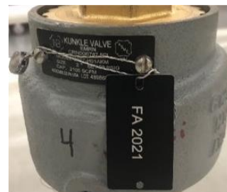
Hanging tag with text "FA 2021"

If you have any questions, please contact your local Emerson Representative.