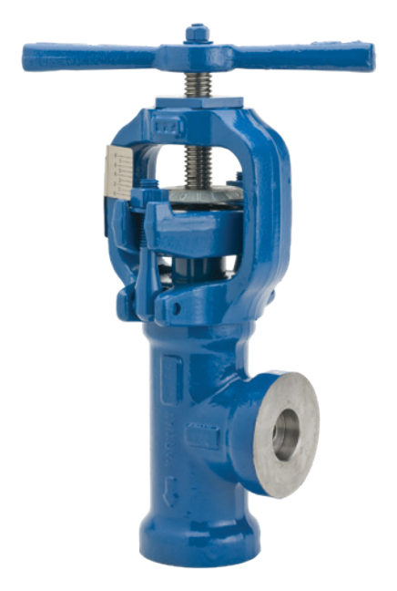
Yarway Hy-Drop throttling valve for blowdown applications

From the most recent follow-through, the customer reported that the installed Yarway valves have been in service for over five years without maintenance or replacement. They also placed multiple orders for Yarway Hy-Drop 5800 throttling valves to replace all the non-ASME-coded globe valves in their other sites.