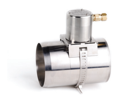
Roxar PDS Pig Detection System