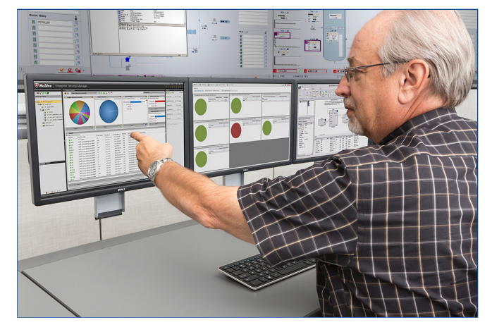
Establish an active defense posture with real-time situation awareness of cybersecurity on the Delta V^{\text{m}} network.