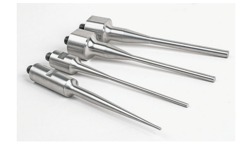
Microtips: These smaller, high-intensity tips are ideal for processing smaller samples in Eppendorf vials or similar vessels. Sizes range from 3/32" to 1/4".