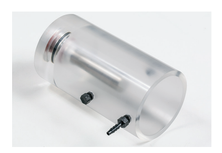
Cup Horn: This specialized horn permits high-intensity sound to be applied to multiple samples without direct horn contact. 3.0" diameter only.

The Sonifier SFX Series can be equipped with a wide range of specialized tools and accessories to meet specific application requirements.