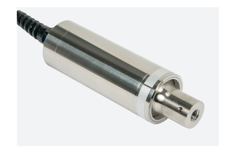
40 kHz Traditional Converter: Used in a stand or acoustic sound enclosure, the traditional converter is designed for longer-duration samples.