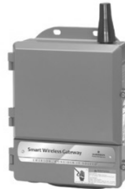
Figure 3. WirelessHART® Gateway

WirelessHART® is a wireless sensor networking technology that is based on the Highway Addressable Remote Transducer (HART®) protocol. It was developed as a multi-vendor, interoperable wireless standard for process field device networks. It is the most widely used standard today and, for this reason, the PVRV described herein was designed to integrate within it. As long as the wireless gateway is WirelessHART®, it will receive the signal from the device. The WirelessHART® gateway will then send the information to a control room which makes use of any number of software integration packages.