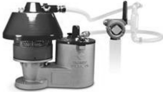
Figure 2. Smart Wireless PVRV

Built-in proximity sensors allow the transmitter to detect the open or closed position of the valves. Signals received by the transmitter can then be sent to a control room via a WirelessHART® Gateway (Figure 3).