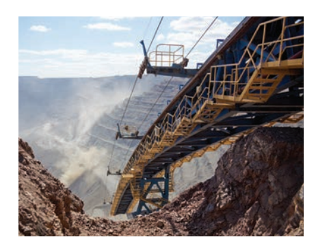
Maintaining long-haul conveyors poses some difficulty for mine staff. Periodic data collection and

Many mines these days are built in remote locations, making it difficult and costly for miners to use conventional haul trucks for ore transport. Instead, miners are installing long-haul conveyors that sometimes span kilometers of treacherous terrain. While more cost-effective, this transport strategy can prove more costly in the event of a conveyor failure as all transport is halted and mine productivity suffers.