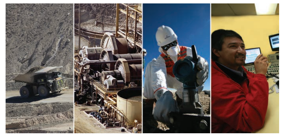
Delivering innovative solutions from pit to plant.

of initiatives, with goals of improving the skills of the local technology ecosystem (universities, R&D centers, and the local workforce), establishing Chile as a center of innovation, and stimulating the Chilean economy.