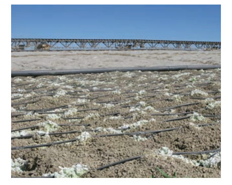
CEI Chile is working in conjunction with miners to develop an intelligent heap leaching control strategy that maximizes metal extraction and achieves safer and more productive

Heap Leaching is the preferred hydrometallurgical process to extract metals from large amounts of low grade ores. Leach pads are very large irrigation operations that percolate leaching solutions onto the ore bed. Typically, these are manual operations in a dangerous environment, issues like plugging, leaks and misdistribution of the leaching solutions. Most heaps have low or nonexistent instrumentation and control, mostly because of the corrosive environment and the lack of proximity to power.