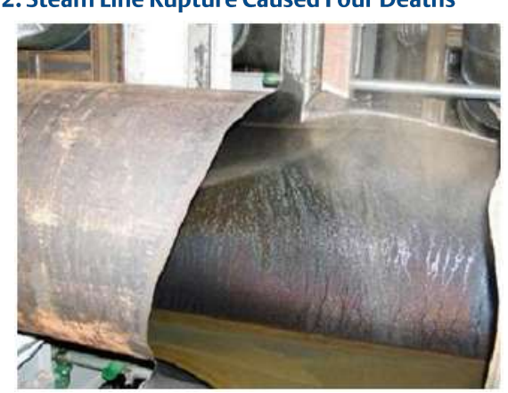
Figure 2. Steam Line Rupture Caused Four Deaths