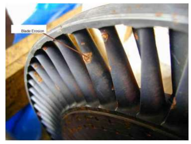
Figure 1. Water Impingement on Turbine Blades