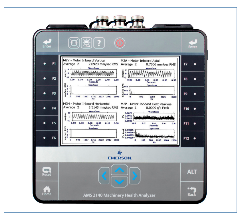
Figure 2: Horizontal, vertical, axial, and special bearing measurements are collected simultaneously on the new four-channel AMS 2140.

A latest-generation four-channel analyzer combined with a triax sensor not only offers 30% faster measurements, but will measure three directions simultaneously (figure 2). In the past you could measure only one channel, the new combination enables you to collect three channels.