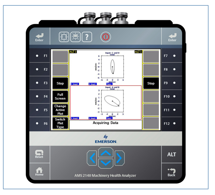
Figure 3: Dual Filtered orbit plot measured with the four-channel AMS 2140.

In addition, dual filtered orbit plots can be measured (figure 3). The AMS 2140 can even gather torsion information.