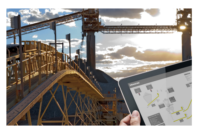
Figure 1. OEMs harness the power of IIoT and edge solutions to help mining operators unlock more productivity from their assets. Using proven hardware/software platforms instead of custom developed projects minimises risk and project costs.

By nature, many goals of an OEM equipment supplier and a mining end user are in alignment. They both want the equipment to perform reliably and be cost-effective,