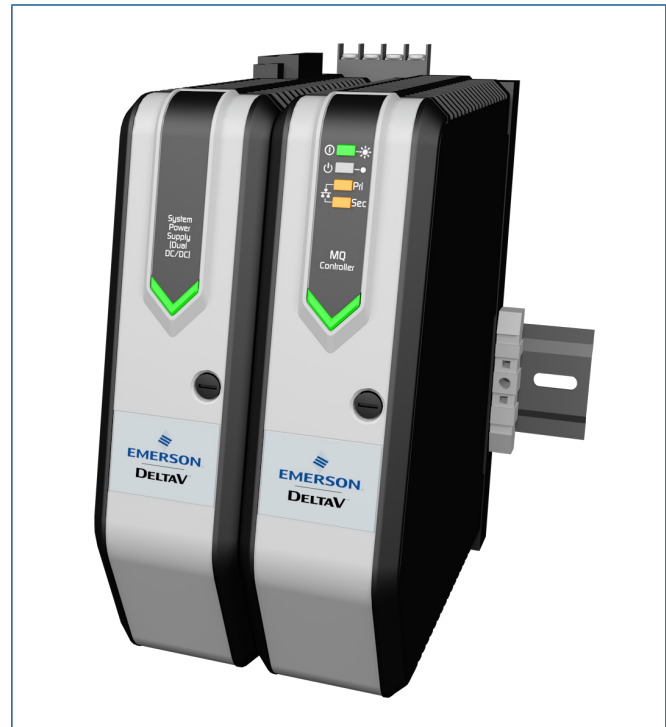
The MQ Controller.

Mounting. This plug-and-play system structure provides modular system growth with a single controller and can be mounted in a Class 1, Div 2 or ATEX Zone 2 environment. Refer to the System Power Supplies and I/O Subsystem Carriers product data sheets for additional information.