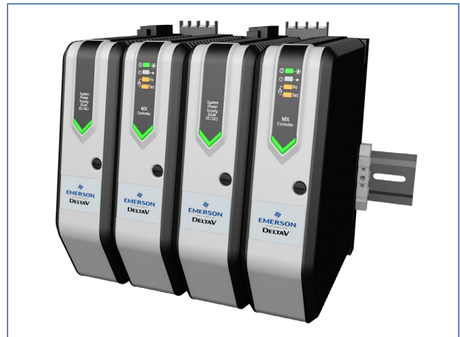
The DeltaV™ MX Controller and the DeltaV I/O subsystem make rapid installation easy.