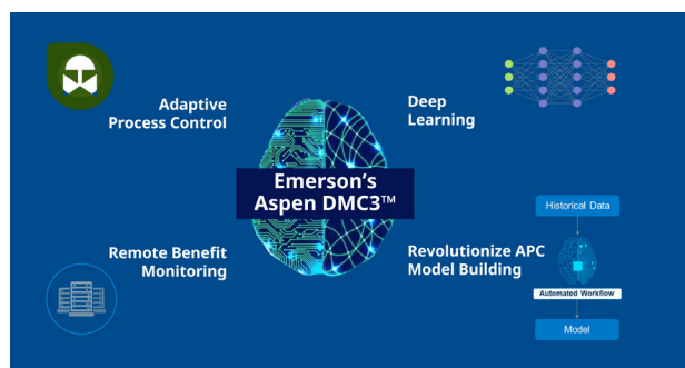
Figure 2. AI tools can help unlock advanced adaptive process control strategies.

than ever before. New cloud-based AI project engineering tools deliver fully integrated digital workflows to help teams modernise, streamline, and standardise their automation configuration. These tools use AI models to evaluate tremendous amounts of historical process data – both an organisation's own historical data from existing facilities and projects, and domain expertise from the automation supplier's decades of experience in LNG and other industries.